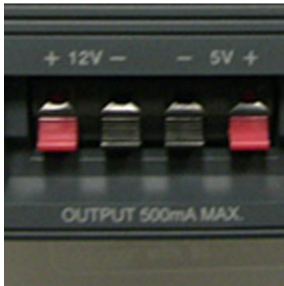
Figure 2: Fixed Voltage Supply