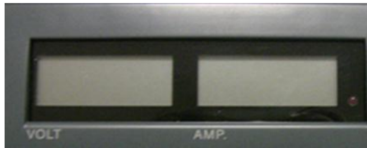
Figure 5: Digital Display