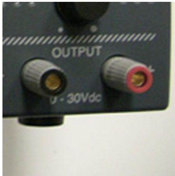
Figure 4: Variable Power Supply Output Jacks