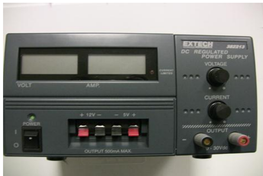
Figure 1: Extech DC Regulated Power Supply

The variable power supply output allows for 2 fixed and 1 variable voltage outputs. Fixed 12 Volt and 5 Volt output terminal jacks are provided, while the remaining output jacks are used for the variable power supply.