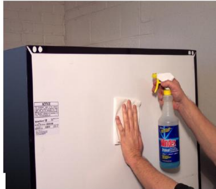
Figure 2: Cleaning back of cooler for CoolerMiser installation