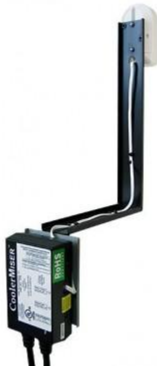
Figure 1: CoolerMiser CM170

A CoolerMiser Slave Unit can also be purchased that allows additional coolers (up to four) to be controlled using a single PIR.